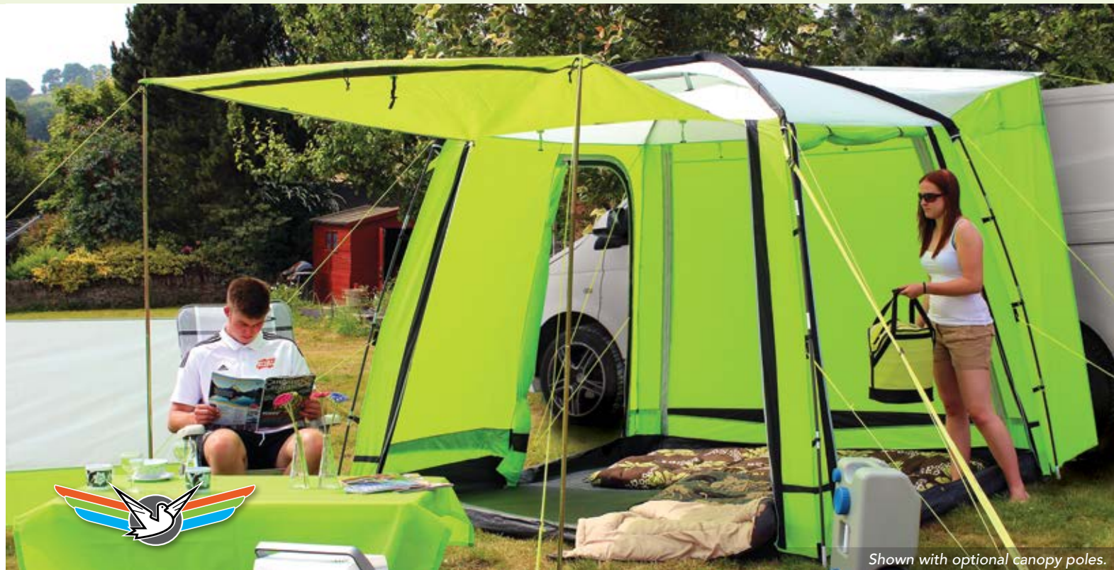
Shown with optional canopy poles.

The Movelite Cayman Snapper is a superb lightweight drive away awning for couples looking for that bit of extra space in addition to their vehicle; specifically designed to attach to smaller vehicles. The 68 Denier material with a 4000mm Hydro static head provides protection from the elements. The shaped fibreglass poles provide maximum headroom inside the awning. Available in three different colours, Chilli, Blue and Lime Green.