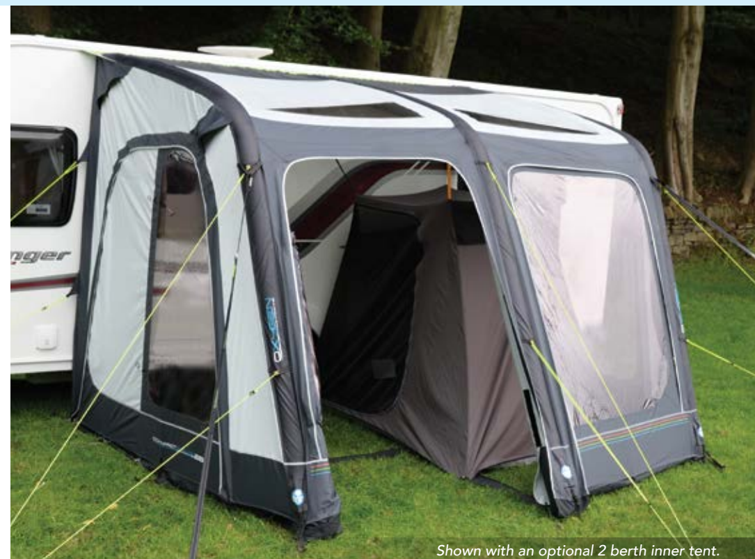
Shown with an optional 2 berth inner tent.

The CompactAirLite 280 is the ultimate lightweight inflatable awning for couples or additional storage space; the exclusive 420 Denier Double Rip-stop Acrylix fabric has the highest tensile strength of any blow up awning material, which no other manufacturer uses. An optional inflatable annexe can be fitted on either side, which creates superb additional sleeping or storage space. The original Dynamic Speed Valve is the easiest, most reliable valve available; this aligned with the exclusive, and patent pending, Intelligent Frame has created the optimum Air Frame on all three Air Frame tubes in this awning! To give added peace of mind, all Air Frames with an Intelligent Frame come with a LIFETIME GUARANTEE* , no other manufacturer has the confidence to offer this.