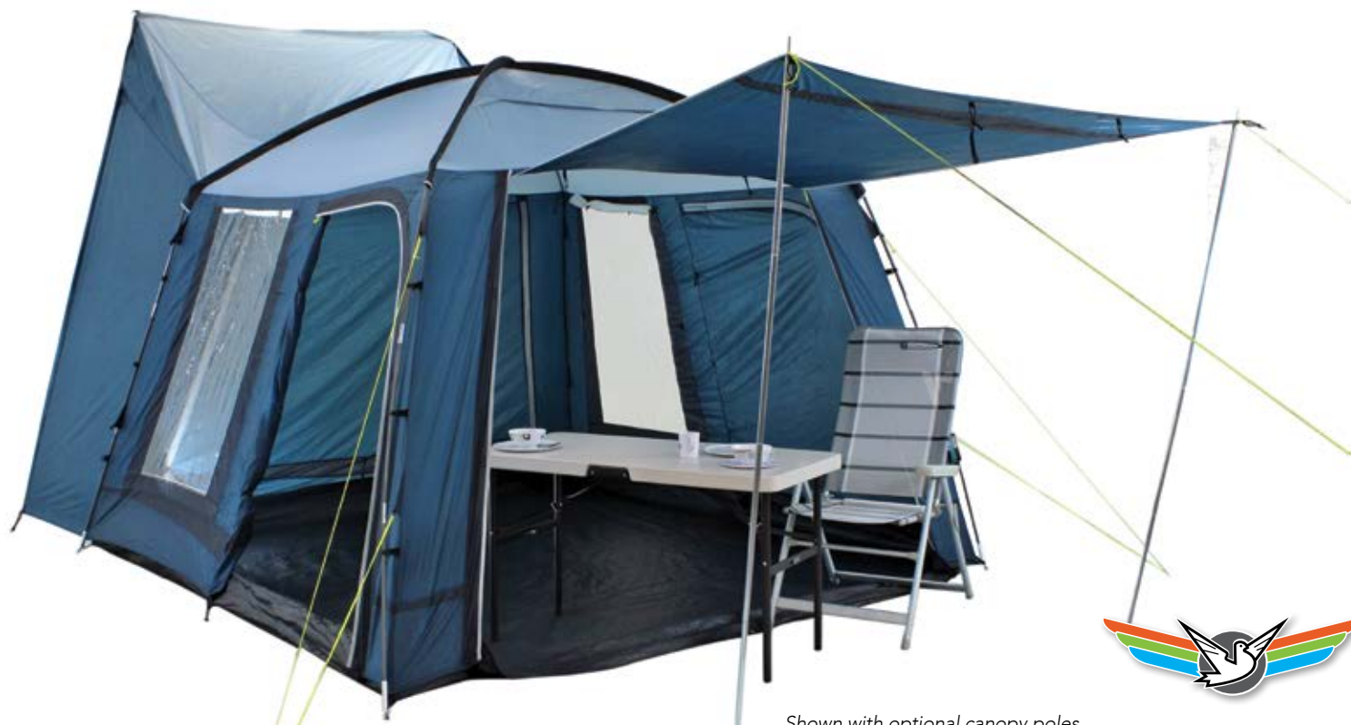
Shown with optional canopy poles.